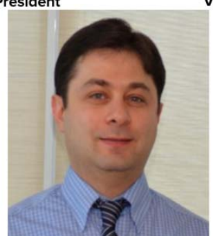
Behzad Rouhieh Communications